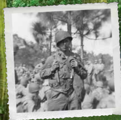
Allied forces made their way through the beautiful, yet treacherous, Normandy countryside.