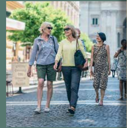
The Art of Traveling in